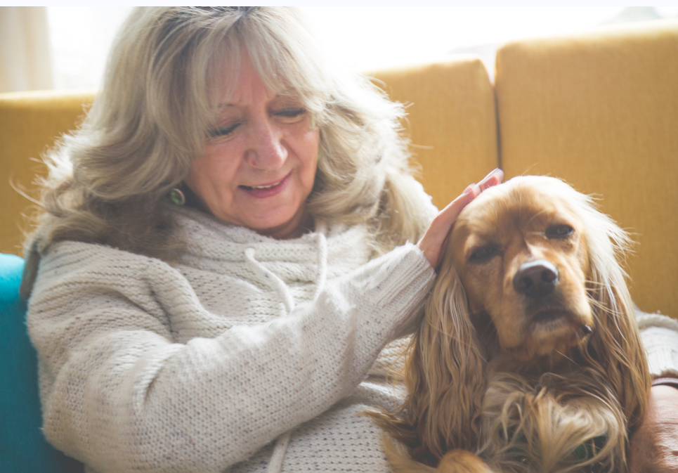
Senior woman sitting on the couch with Cocker Spaniel dog.

Cat's claw's high antioxidant content helps the body neutralize free radicals, and some studies show it may even aid in mobility and promote joint health.